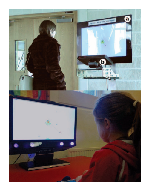
FIGURE 3. Naïve users successfully use Pursuits-enabled interfaces without directions during field experiments (a: display, b: eye tracker).

pursuit movements require the interface to be dynamic, i.e. with the objects of interest moving with different trajectories and speeds. While this requirement might be problematic for interfaces that follow the traditional WIMP (windows, icons, menus, pointer) paradigm or use static interface elements, Pursuits is predestined for highly dynamic interfaces, such as interactive multimedia installations or games. Beyond such special-purpose interfaces, Pursuits also encourages to break out of conventional thinking with respect to how future gaze-based interfaces might be designed and look like.