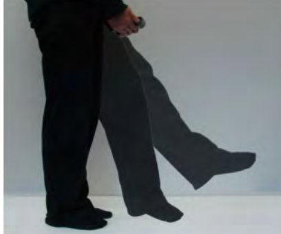
Fig. 3: Example scenario for the use of foot gestures through intrinsic sensing. The user interacts with his tablet by kicking in the air [Han et al. 2011]

works of Springer and Siebes [Springer and Siebes 1996] and Göbel et al. [Göbel et al. 2013].