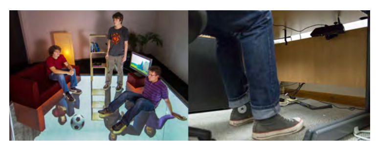
Fig. 4: Extrinsic sensing from below with an FTIR floor [Bränzel et al. 2013] and from above with a Kinect sensor [Simeone et al. 2014]

cycle [Watanabe et al. 2005]; assisting navigation [Frey 2007]; and even changing the noise of users' footsteps [Lécuyer et al. 2011]. A commercial example is the Nike+iPod (2006) line of trainers, which measures and records the distance and pace of a walk or run. From users' gait pattern it is also possible to infer their trajectories using a technique called pedestrian dead reckoning . Fischer et al. describe how to achieve this using inertial sensors mounted on the foot [Fischer et al. 2013].