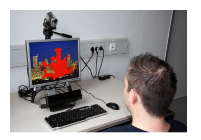
Figure 3: Gaze-based graphical password entry [2].