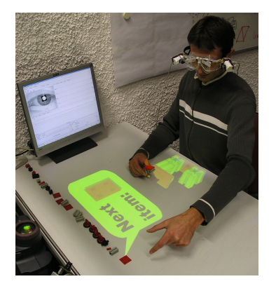
Figure 2: Gaze-based interaction in physical interaction contexts [1].

Figure 1: Gaze-supported exploration of a large image collection on a distant display with a handheld smartphone [10].